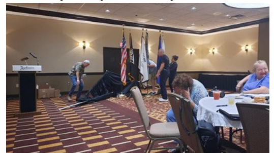
OOOPS! All Fall Down.