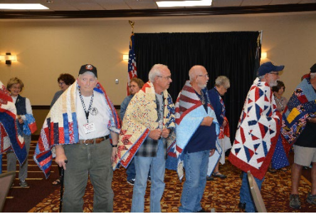
Proud AC-119 Brothers With QOVs.