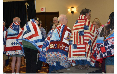
More Back Artwork of QOVs.