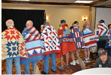
Back Side Artwork of QOVs.