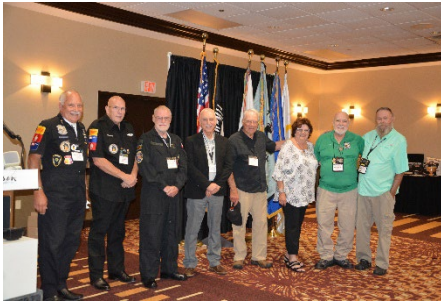
2023 Board of Directors