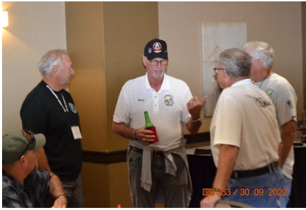
Gathering of the 119 minds.