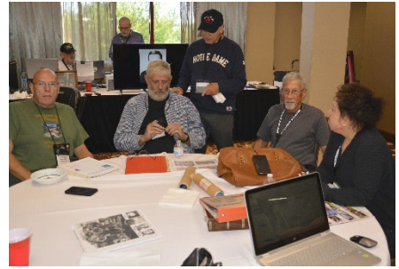
Hanging Out In The Hootch.