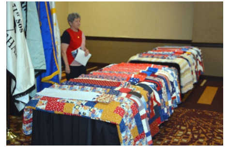
QOVs Awaiting Presentations