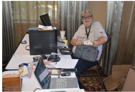
Ev at Media Central.