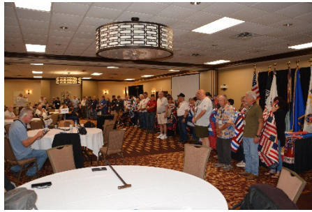
Lineup For The QOV Presentations.