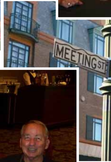
Reunion XII Charleston, SC