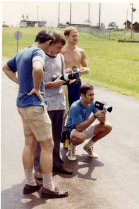
Left, The Nakon Phanom Camera Crew looks on. Anyone look familiar?