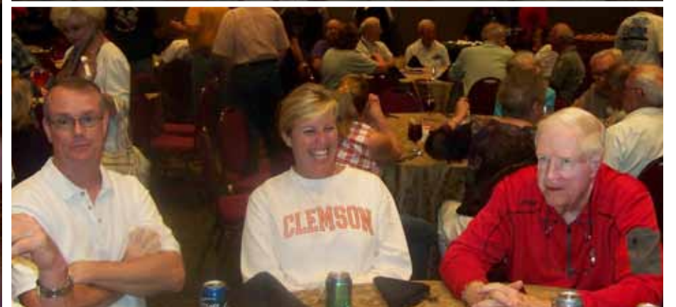
Firing Circle 7