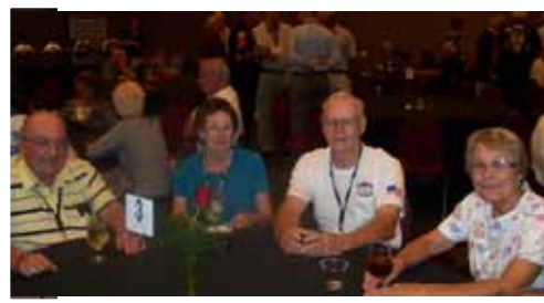
Firing Circle 6