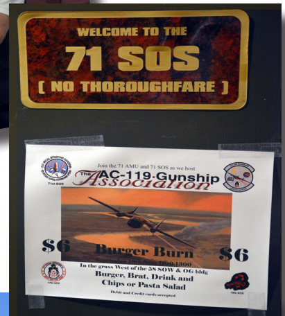
71st SOS Burger Burn invite sign to the right and a CV-22 Osprey below.