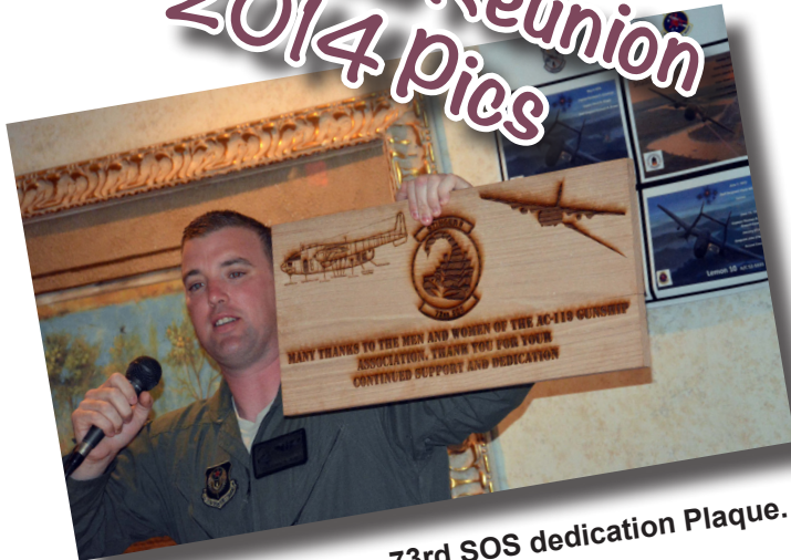
73rd SOS dedication Plaque.