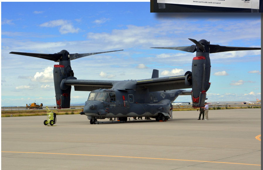
Firing Circle 8