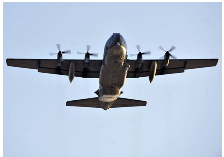
A MC-130W Dragon Spear from the 73rd Special Operations Squadron.

Combat Spears can receive fuel from other airborne tankers via its Universal Aerial Refueling Receptacle Slipway Installation.