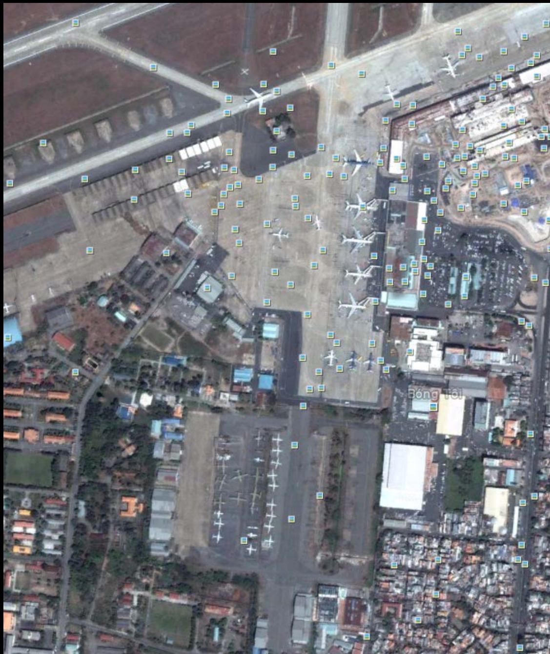
March 2006 satellite image