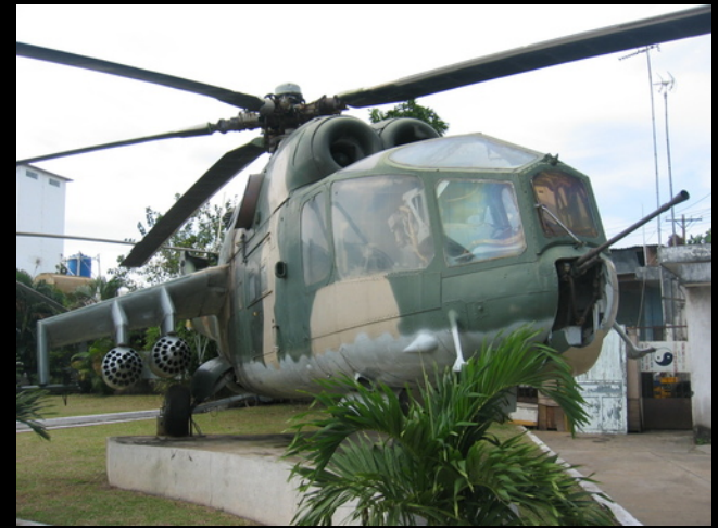
Mi 24A Hind Helicopter