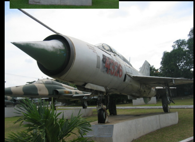
MiG-21 MF Fighter Jet