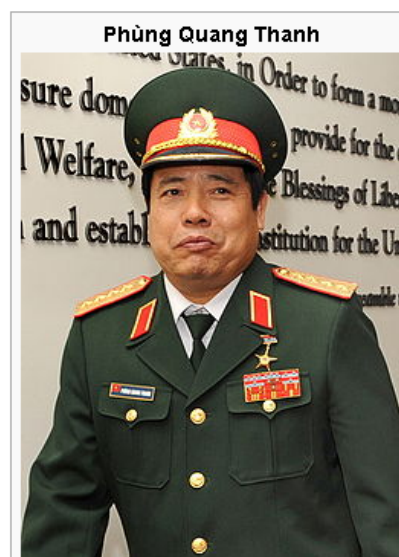
General Phung Quang Thanh in December 2009